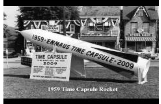
1959 Time Capsule Rocket