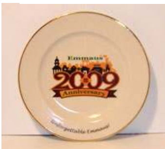
2009 Anniversary Commemorative Plate available for $25.00

Don't miss this opportunity to preserve a special piece of history for your family. There remains for sale a small number of Emmaus 2009 Anniversary Limited Edition Collector's Plates. The front bears the 2009 Anniversary Logo. The back recites a hymn penned by Moravian Bishop Joseph Spangenberg upon the naming of Emmaus: