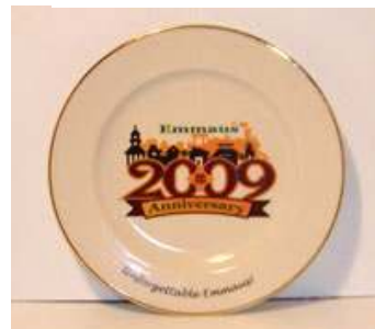
2009 Anniversary Commemorative Plate available for $25.00

Don't miss this opportunity to preserve a special piece of history for your family. There remains for sale a small number of Emmaus 2009 Anniversary Limited Edition Collector's Plates. The front bears the 2009 Anniversary Logo. The back recites a hymn penned by Moravian Bishop Joseph Spangenberg upon the naming of Emmaus: