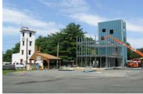
The new Fire Training Building nearing completion

The Emmaus Fire Department began work on developing a fire training facility in 1964. With donations raised through a fund drive, it built a 4-story fire training tower in 1967. The new facility will afford expanded training options for Emmaus firefighters and those in surrounding organizations.